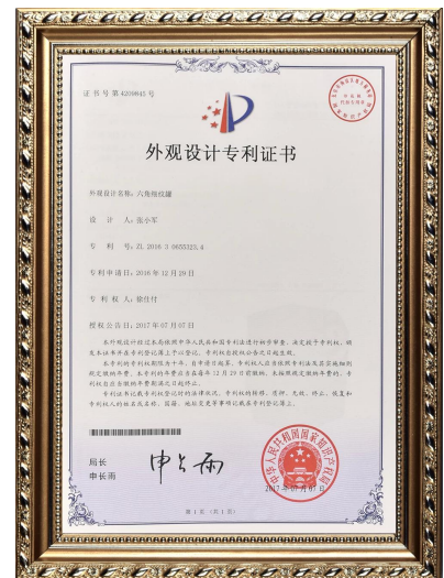
Paten n.: 201.630.655.323.4