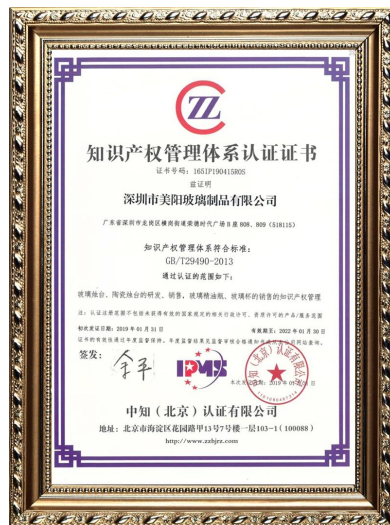
Hartanah intelek perniagaan