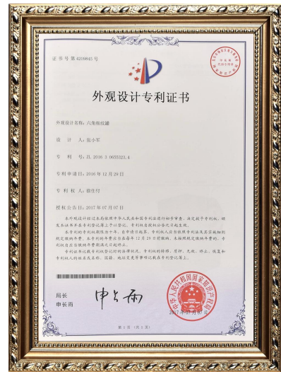
Nombor paten: 201630655323.4