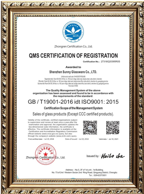
ISO 9001: 2015