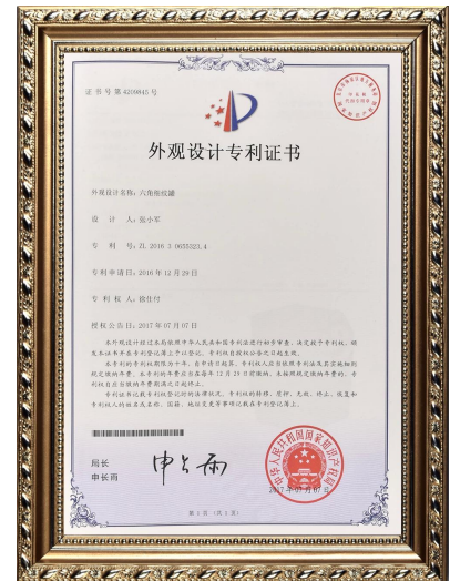
No. Paten: 201630655323.4