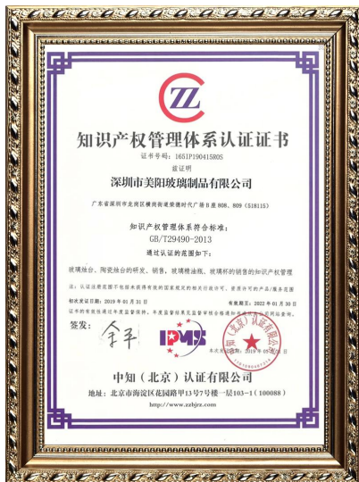
Harta Intellek Perusahaan