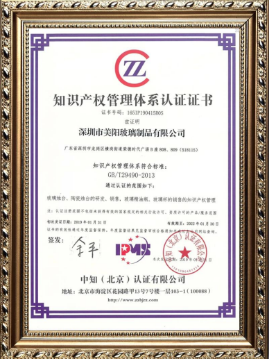
Harta intelektual perusahaan