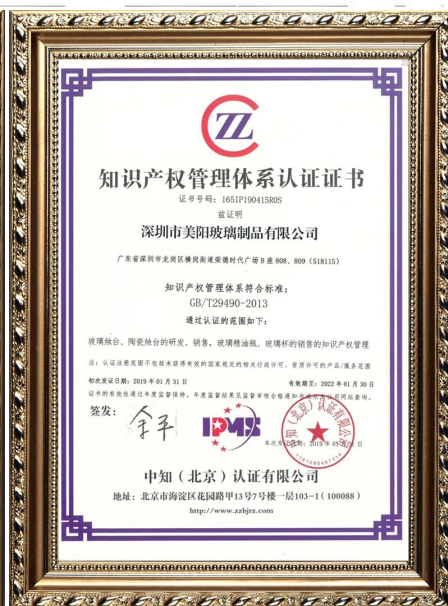
Harta intelek korporat