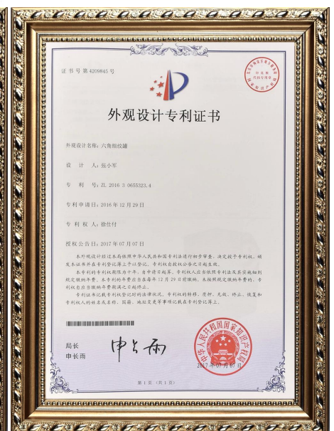
No. Paten: 201630655233.4