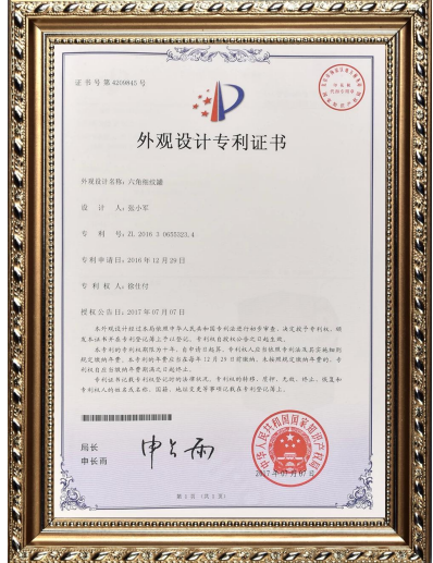
Nombor Paten: 20163065523.4