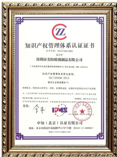
Harta Intelek Perusahaan