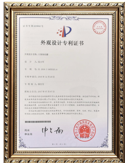
No. Paten: 201630655323.4