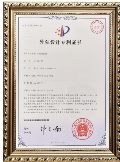
Nombor Paten: 201630655323.4