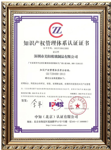
Harta intelek perusahaan