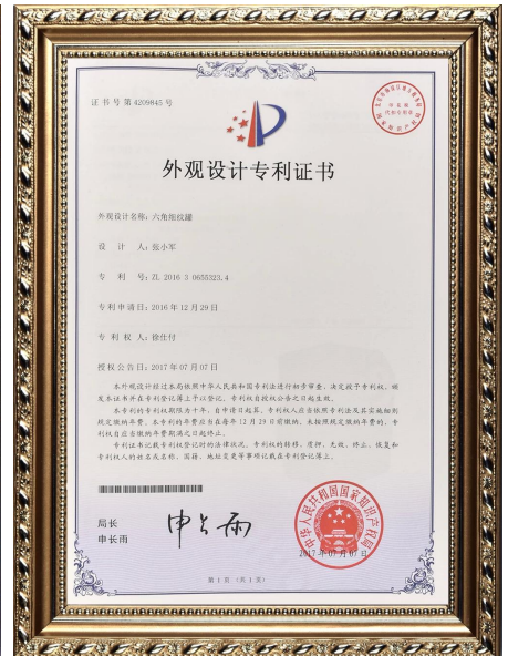
Nombor Paten: 20163065323.4