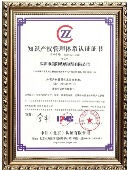
Harta Intellek Perusahaan