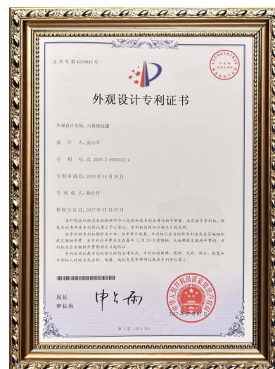
Nombor Paten: 201630655323.4