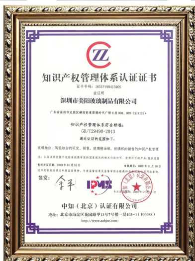
Harta intelek perusahaan