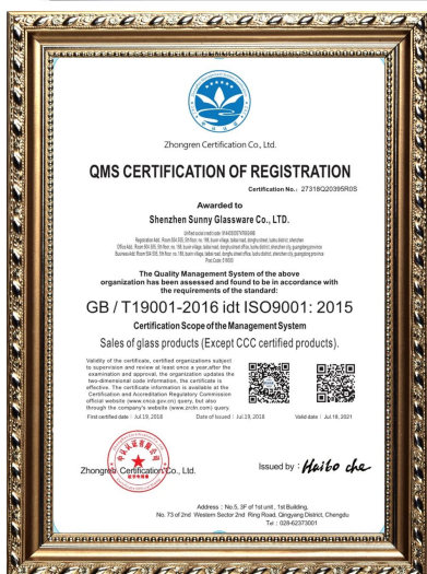
ISO 9001: 2015