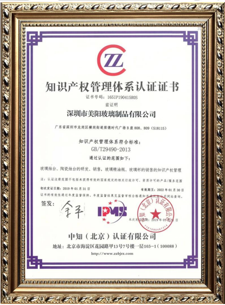
Harta Intelek Perusahaan