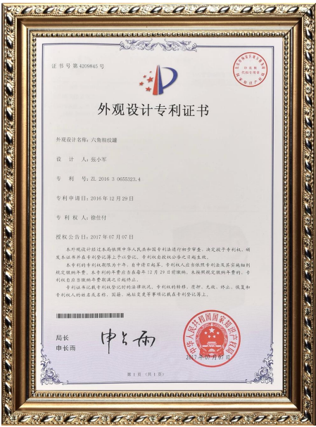
Nombor Paten: 201630655323.4