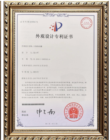
Patent Number: 201630655323.4