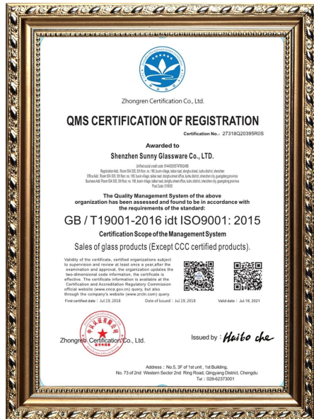
ISO 9001: 2015