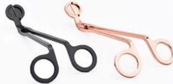
Wick Trimmer Cutter