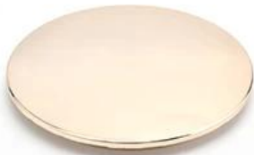
Zinc Alloy Cover