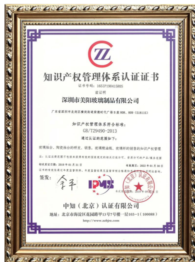
Harta intelek korporat