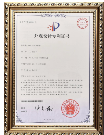
Paten No.: 201630655323.4