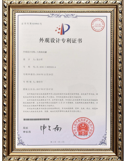
Nombor Paten: 20163065532.3