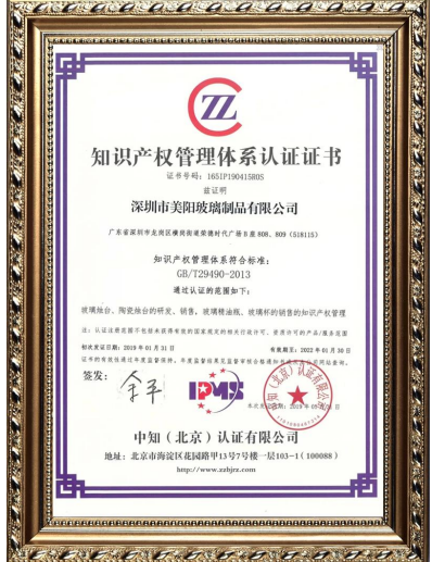
Hartanah Intelektual Syarikat