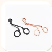
Wick Trimmer Cutter

Makan malam hiasan di bar atau bar Sesuai untuk keluarga, hotel atau taman Hadiah Kekasih Khas Sebarang peluang hiasan