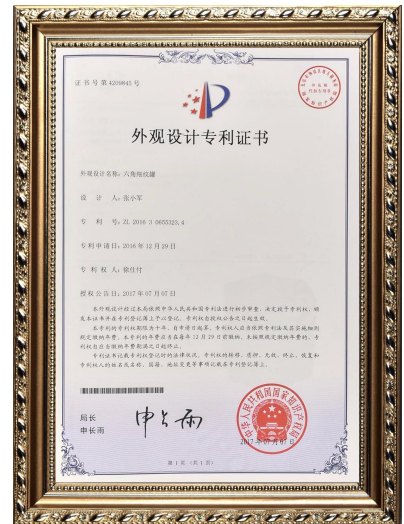
Nombor Paten: 201630655323.4