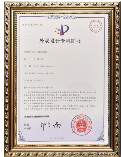
Nombor Paten: 201630655323.4