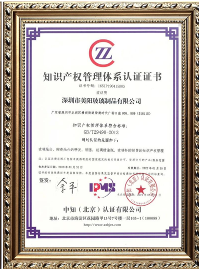
Harta intelek korporat