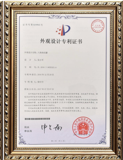
Paten No.: 201630655323.4