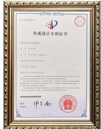
Nombor paten: 201630655323.4