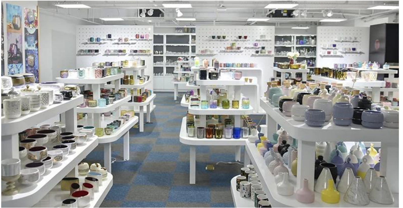
pakej AND pengangkutan