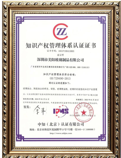
harta intelek syarikat