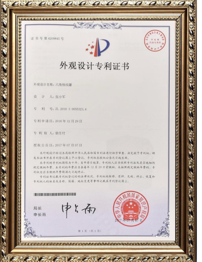
Nombor Paten: 20163065532.4