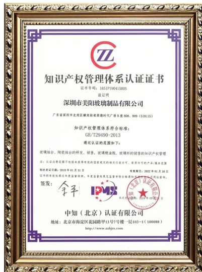
Harta Intellek Perusahaan