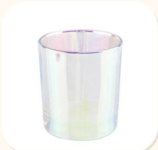
Glass Candle Vessel