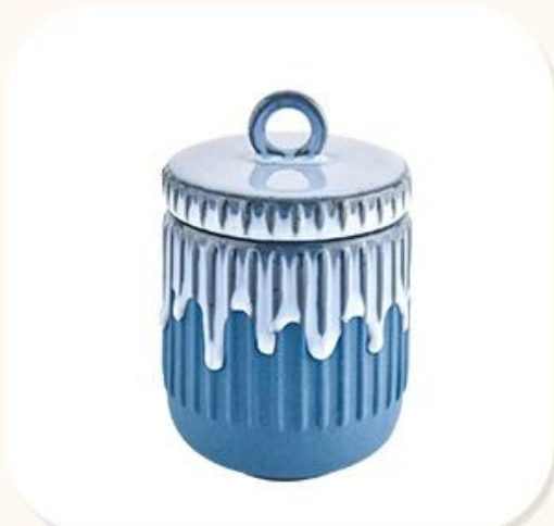
Ceramic Candle jar