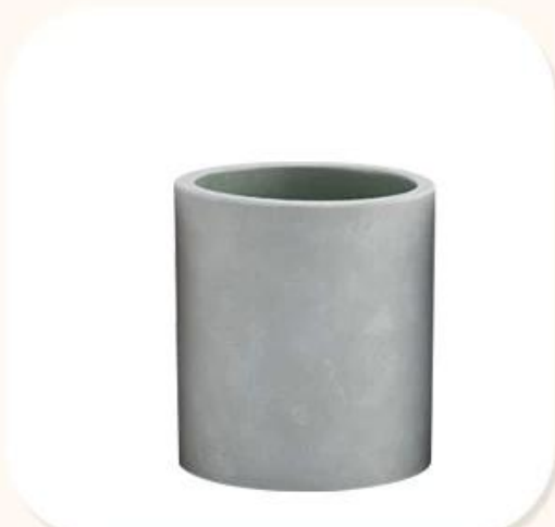
Cement Candle jar