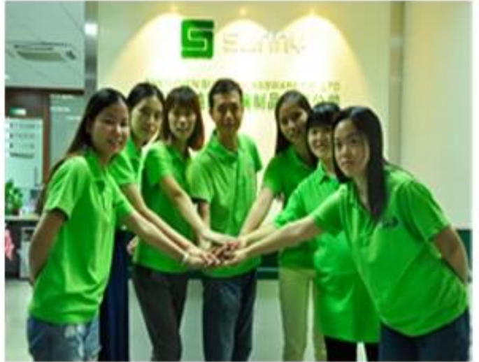
Sourcing & Doc Team