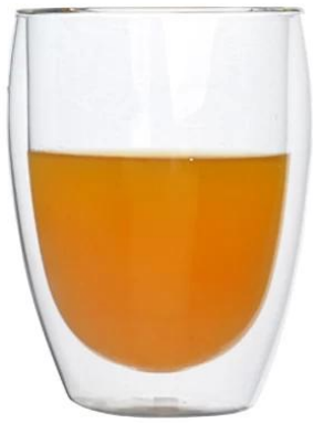
200ml Borosilicated Glass Tumbler