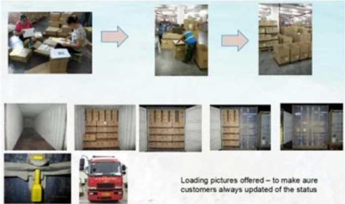
Loading pictures offered – to make sure customers always updated of the status