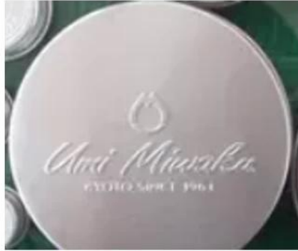
embossed logo on the lids