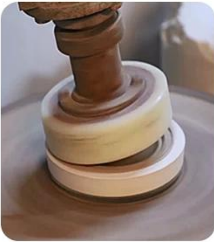
1. Roll forming