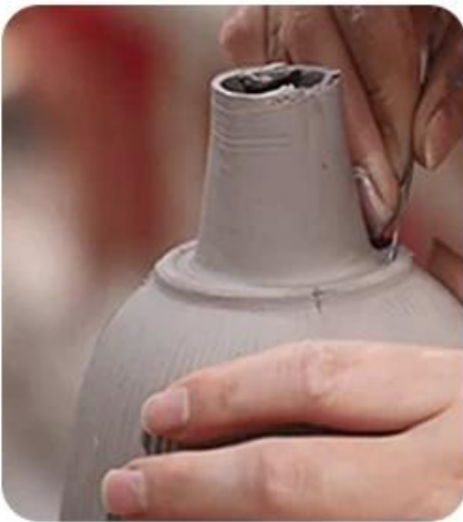
4. Refine the body