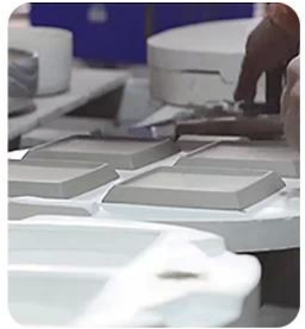
3. High pressure