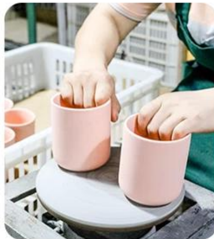
8. Quality control