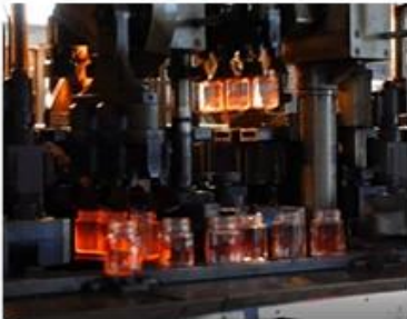
The ranks of machine