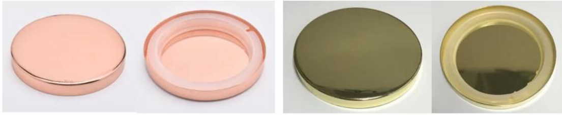
Rose gold color