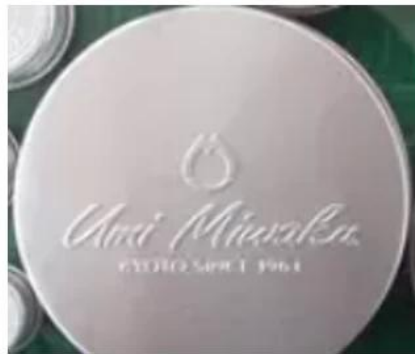
embossed logo on the lids