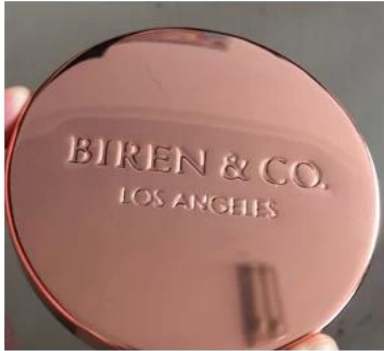
intagliated logo on the lids