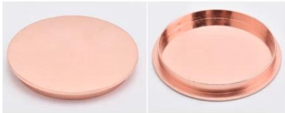
Rose gold color