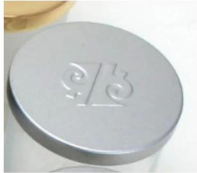
embossed logo on the lids