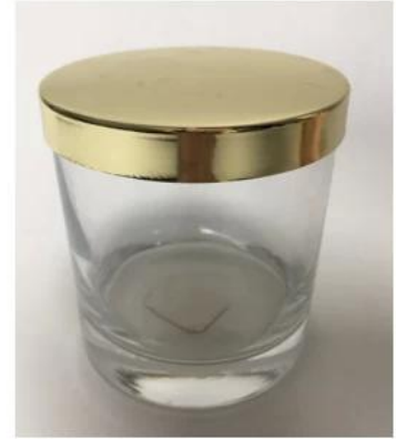
effect on the jar