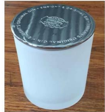
effect on the jar