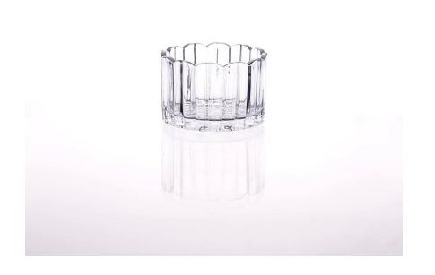
colored glass candle cup