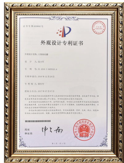
Patent Number: 20163065532.4