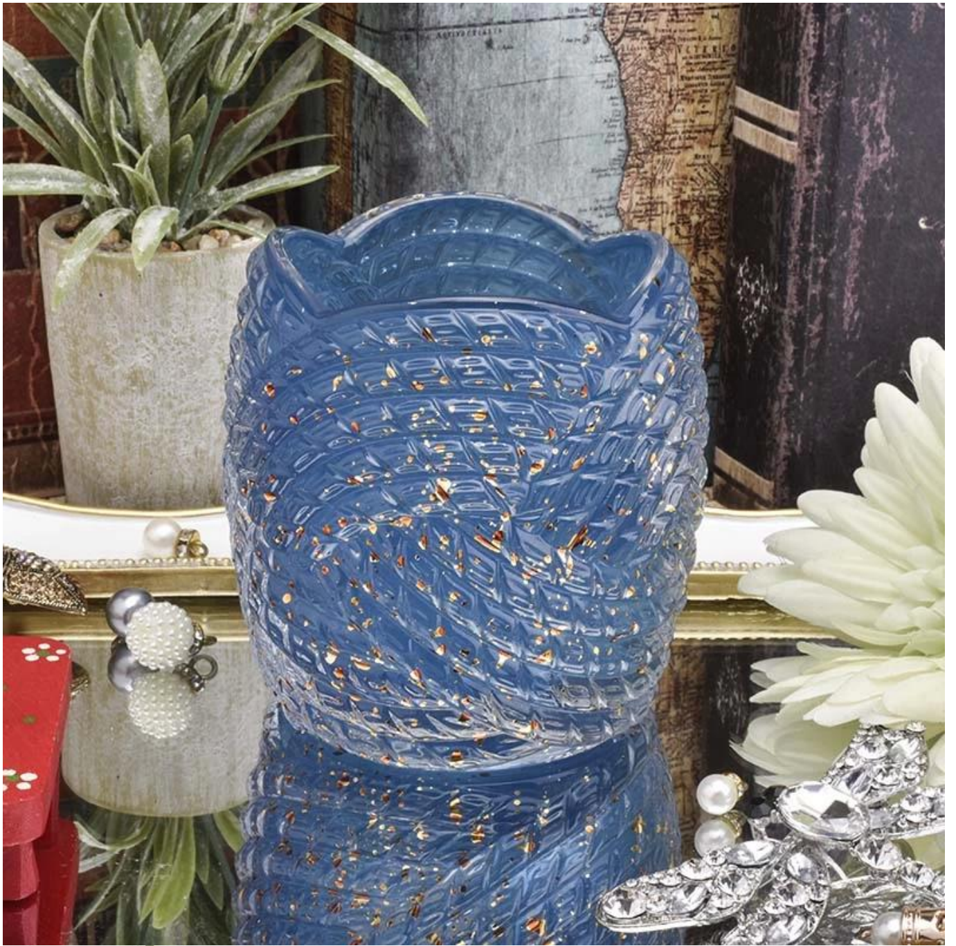
Office & Sample Room