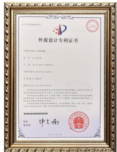
Numero di brevetto: 201630655323.4