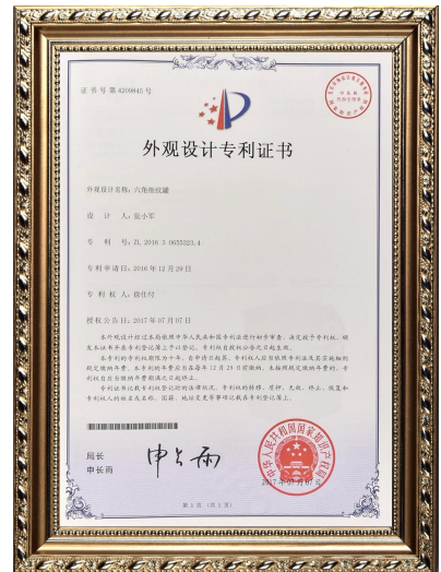
Numero di brevetto: 201630655323.4