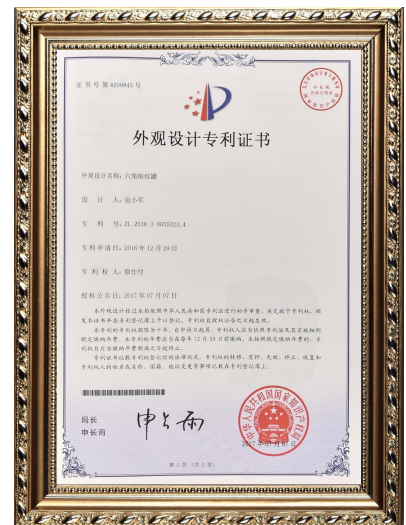
Numero di brevetto: 201.630.655.323,4