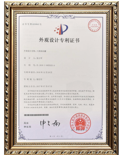
Brevetto n.: 201630655323.4