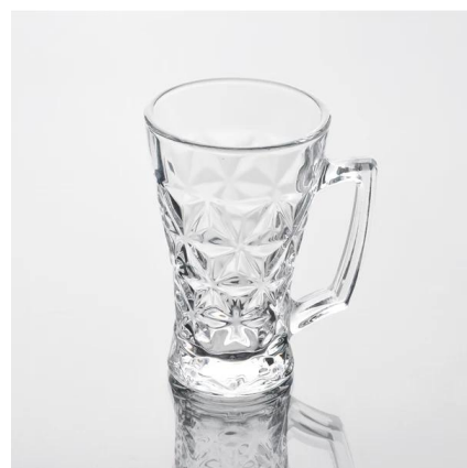
wholesale glass mug