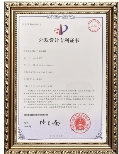
Numero di brevetto: 201630655323.4