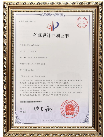
Numero di brevetto: 201630655323.4