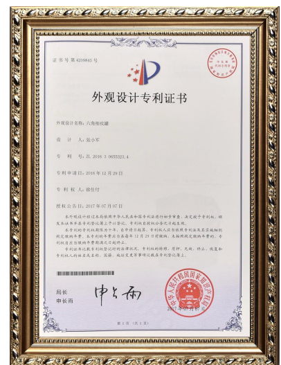
Numero di brevetto: 201630655323.4