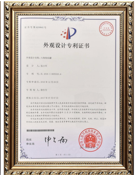
Numero di brevetto: 201630655323.4