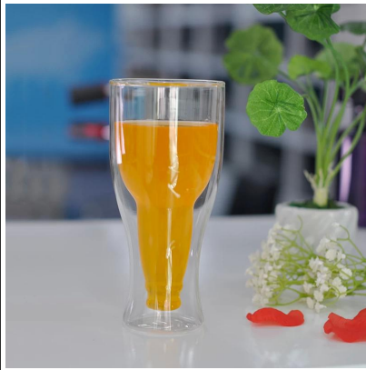
Double wall glass double wall beer glass