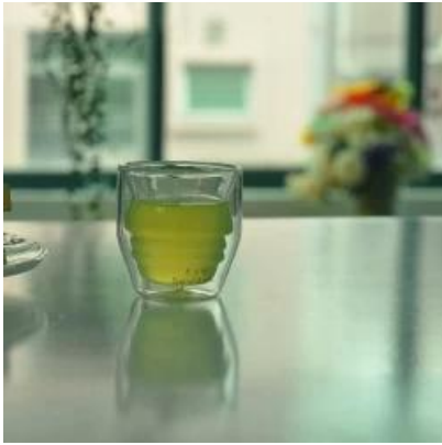
Pyrex coffee cup