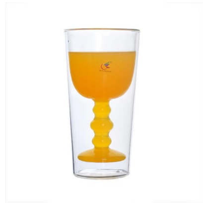
Double wall juice cup double wall glass cup