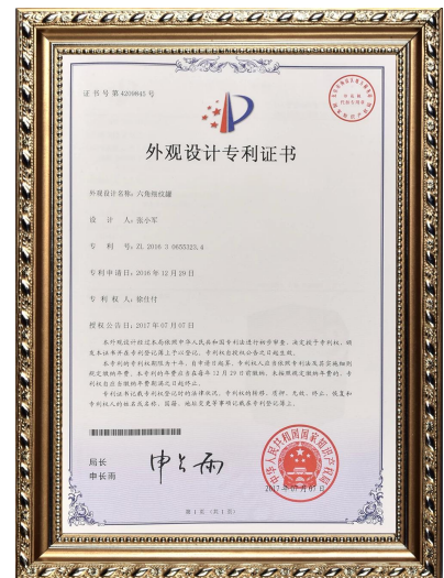
Brevetto n.: 201630655323.4