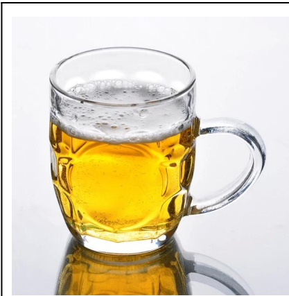
machine made beer glass