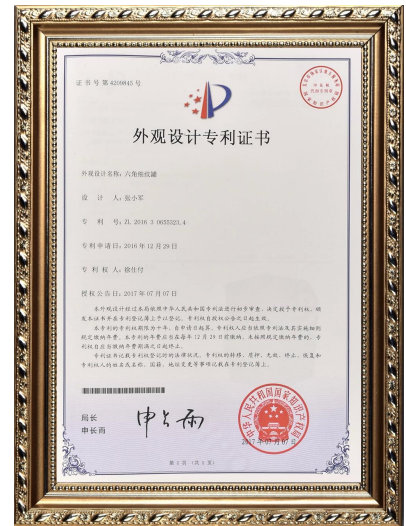
Numero di brevetto: 201630655323.4