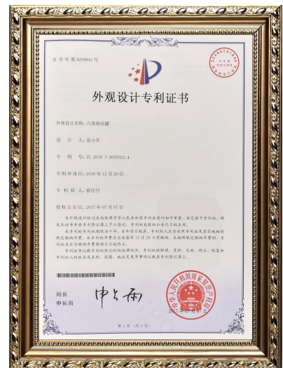
Numéro de brevet: 20163065532.4