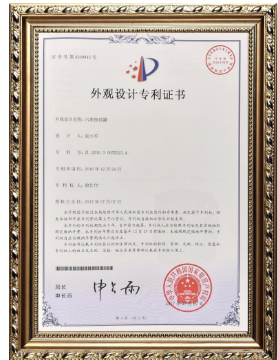
Numéro de brevet: 201630655323.4