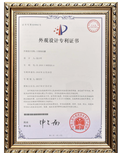
N ° de brevet: 201630655323.4