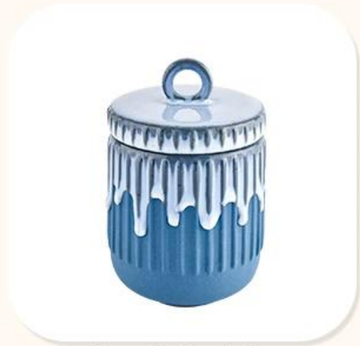
Ceramic Candle jar