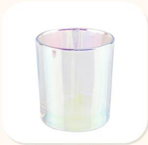
Glass Candle Vessel