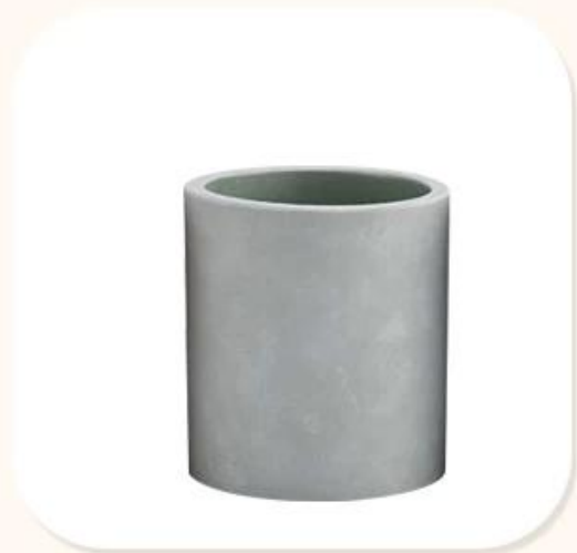
Cement Candle jar